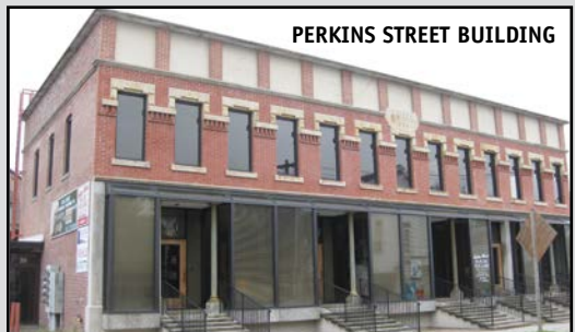
PERKINS STREET BUILDING

• LOCATION • LOCATION • LOCATION • ONE & TWO STORY INTERCONNECTED