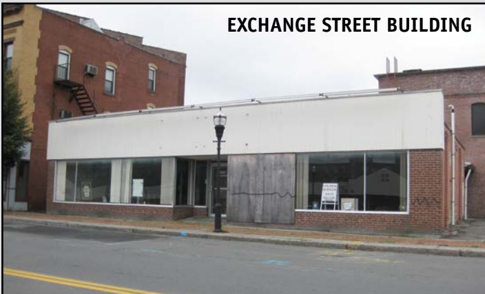
EXCHANGE STREET BUILDING