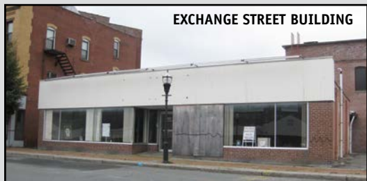
EXCHANGE STREET BUILDING