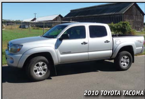
2010 TOYOTA TACOMA

WEDNESDAY, OCTOBER 9 TH AT 11:00 A.M. 47 PLANTATION ROAD BROAD BROOK, CONNECTICUT