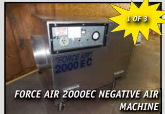
FORCE AIR 2000EC NEGATIVE AIR MACHINE