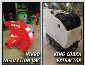
NIKRO INSULATION VAC