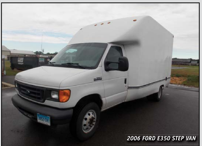
2006 FORD E350 STEP VAN