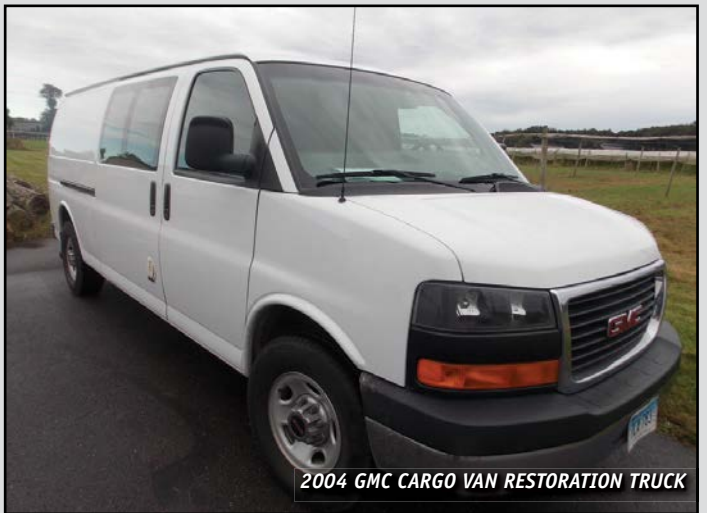
2004 GMC CARGO VAN RESTORATION TRUCK