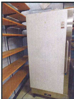
True 1D Freezer