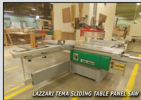
LAZZARI TEMA SLIDING TABLE PANEL SAW

12% BUYERS PREMIUM APPLIES ON ALL ONSITE PURCHASES 12% BUYERS PREMIUM APPLIES ON ALL INTERNET BIDDERS