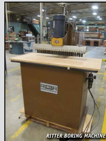
RITTER BORING MACHINE