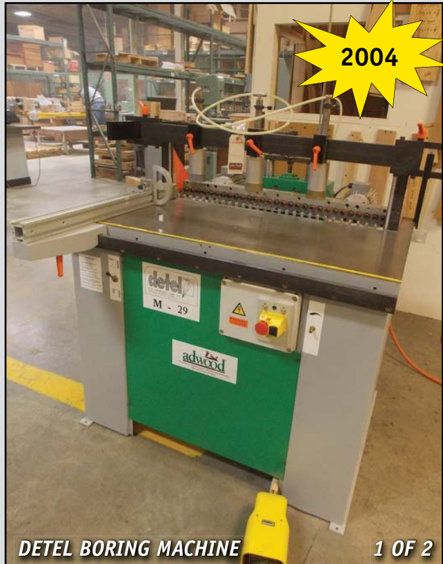
DETEL BORING MACHINE