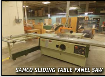
SAMCO SLIDING TABLE PANEL SAW