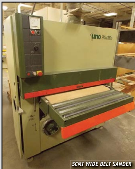
SCMI WIDE BELT SANDER

THE INFORMATION DESCRIBED IN THIS BROCHURE IS CORRECT TO THE BEST OF OUR KNOWLEDGE BUT WE CANNOT GUARANTEE SAME. IT IS FOR THIS REASON THAT BUYERS SHOULD AVAIL THEMSELVES OF THE OPPORTUNITY FOR INSPECTION PRIOR TO THE SALE.