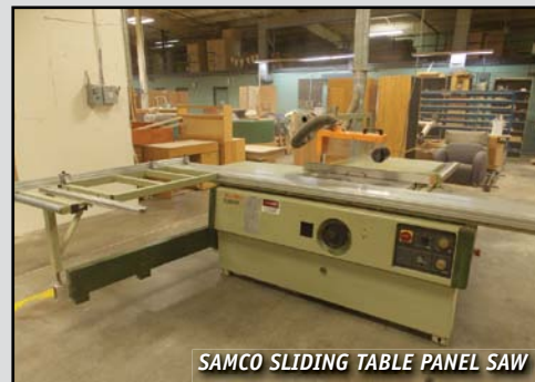
SAMCO SLIDING TABLE PANEL SAW