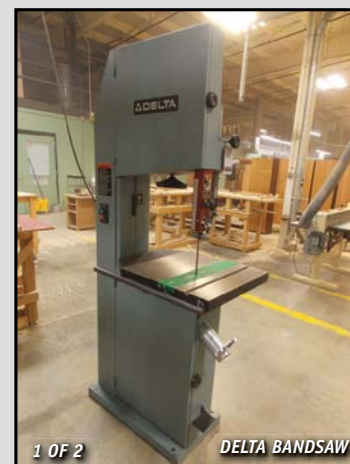
1 OF 2