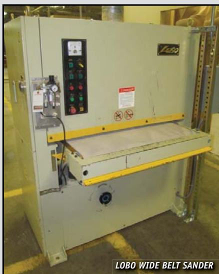
LOBO WIDE BELT SANDER