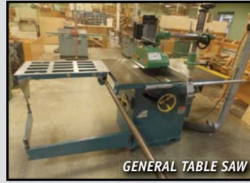
GENERAL TABLE SAW