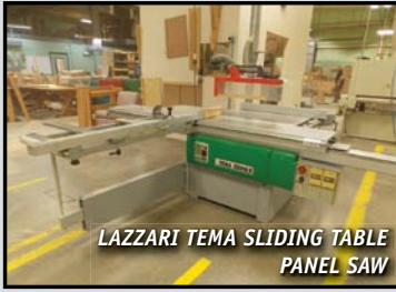
LAZZARI TEMA SLIDING TABLE PANEL SAW