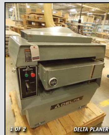
1 OF 2